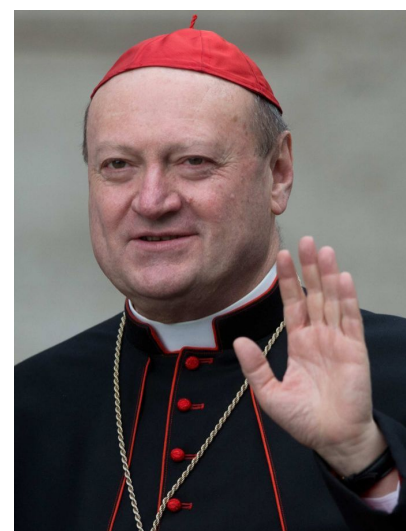
Cardinal Gianfranco Ravasi will visit Loyola University Chicago in March